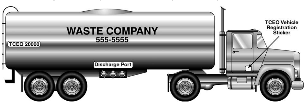
Figure 1. Example of vehicle marking and sticker placement.