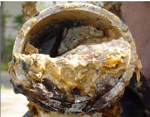
Wastewater line clogged with grease

Corpus Christi's City Code Sec. 55-200-224 requires all grease interceptors be cleaned out at least once every three months or sooner if the contents of the interceptor contains 25% or more of grease and solids.